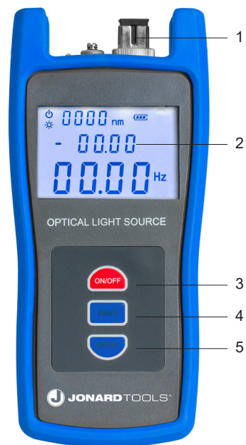
Diagram of the FLS-50