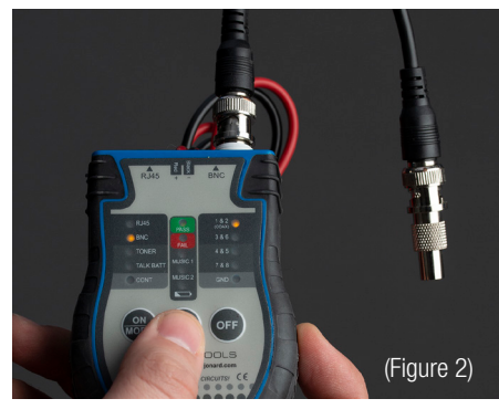
TET-700BC - Cable Tester & Toner+ w/ ABN

To use the TET-700BC as a Cable Tester & Toner+ w/ ABN, follow these basic instructions: