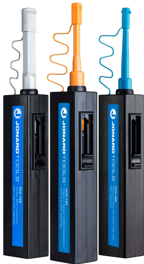
FCC-120 FCC-125 FCC-250